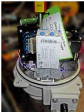
Timer Control Option