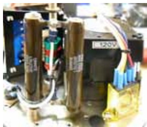
Cold Weather Kit

Our Electric Actuators are incredibly robust products. They can be configured for different voltage or control specifications, but also with several different options.