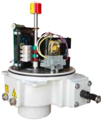
P2 Electric Actuator With 2 Wire Control