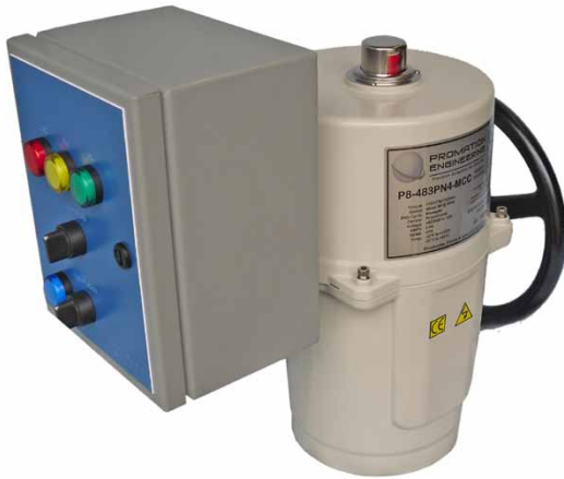
P7 three phase actuator with standard Motor Control Center

In an industrial environment with three phase power readily available, there are several reasons three phase power just makes good sense. The main reason to use a three phase motor is that it runs more efficiently than a comparably sized single phase motor. This translates to the motor running cooler, with a longer life, and most importantly, it will use less electricity. Whether you require single phase or three phase actuators, ProMation Engineering has you covered with available quarter-turn actuators.