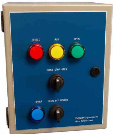
Motor Control Center (MCC) for a three phase industrial electric actuator

Incoming Power: Three phase power wiring can be more difficult and expensive than is single phase power for a new installation. This is the most common aversion to using three phase actuators. If reliable three phase power is already available it makes sense to explore the benefits of a three phase actuator. Companies with multiple actuators can save a great deal in electrical costs by using three phase actuators.