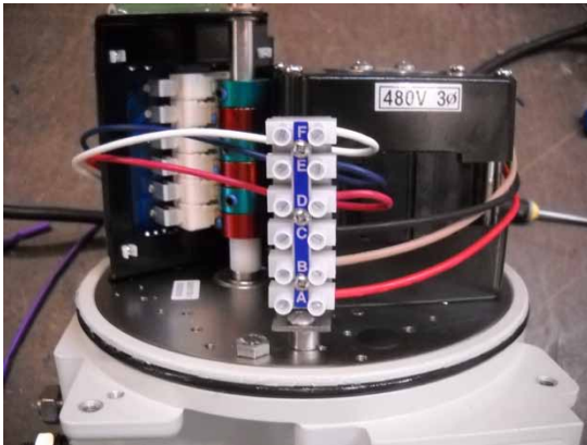
480 Volt 3 Phase Motor and internal connections