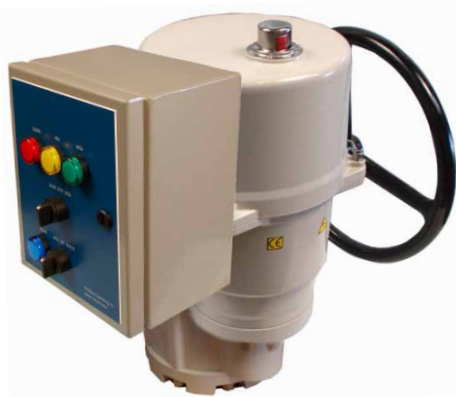
P11-480 3 Phase Industrial Quarter-Turn Electric Actuator with Motor Control Center