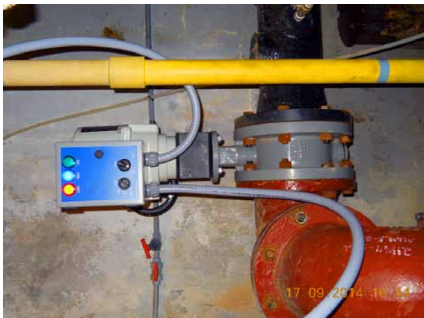
P8-120N4-TS with Torque Switch and Local Control Center at a water treatment plant.