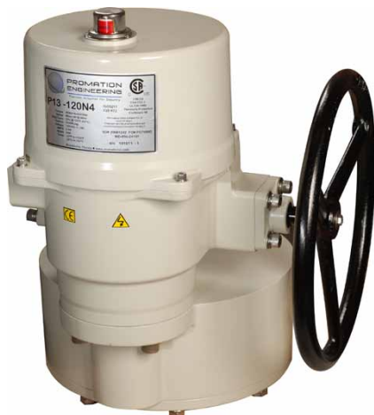
P13-120N4, 40,000 in lbs torque

Versatile: All are available for 120VAC or 230VAC single phase or 220 through 575 3-Phase supplies (with or without motor control center). Select units also have low voltage 12 and 24 VAC and VDC options. Nearly every actuator we offer can be custom engineered to match your specifications, from Local Control Stations to Cold Weather Heaters.