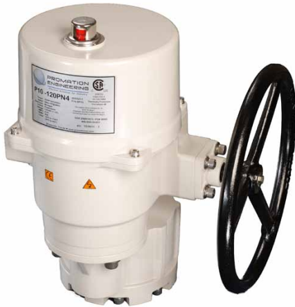
P10-120PN4 Proportional Electric Actuator for industrial valves and dampers