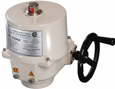
P6-24N4 Proportional Electric Actuator for industrial valves and dampers