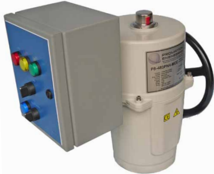
P8-483PN4 with Motor Control Center. 13,250 in lbs torque.