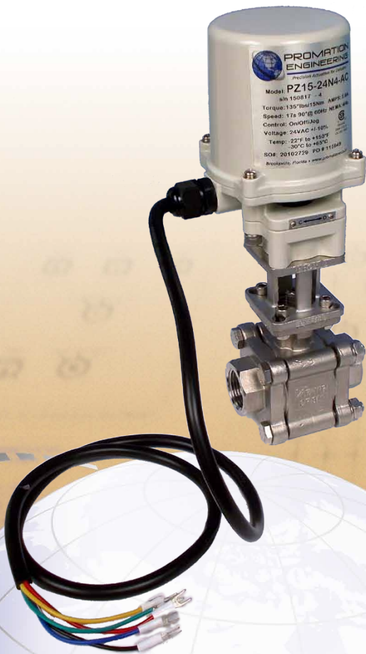
PZ15-24N4-AC Series Actuator with linkage kit on 3/4" stainless steel ball valve

Get more work done with five ultra compact or compact 24 volt actuators spanning 3 torque ranges