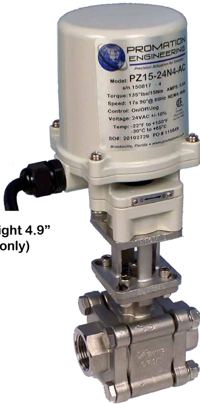
PZ Actual Height 4.9” (Actuator only)

Available in bulk packs OR call for project pricing.