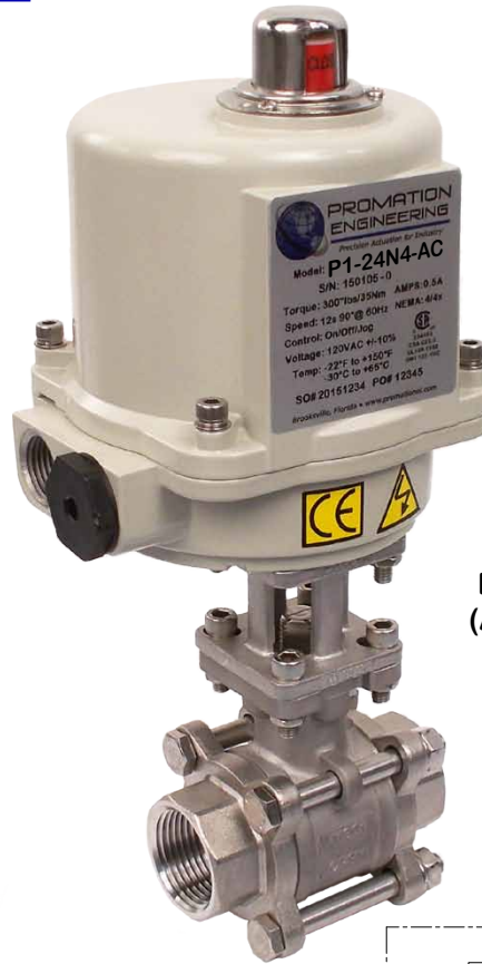
P1 Actual Height 5.9” (Actuator only, On/Off)