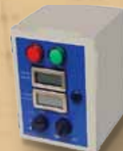
LCS-K Local Control Station