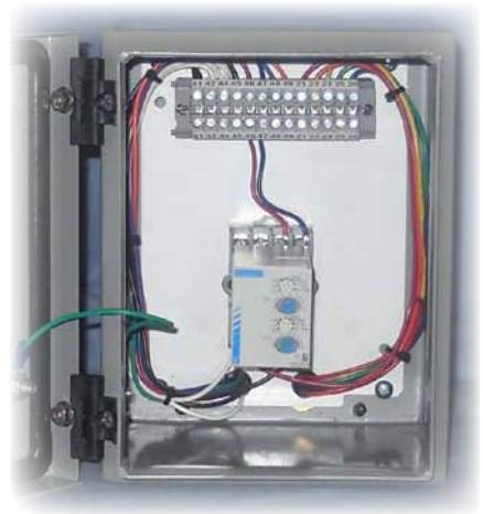
Timer Option installed in an external housing for a P1-120VAC series actuator