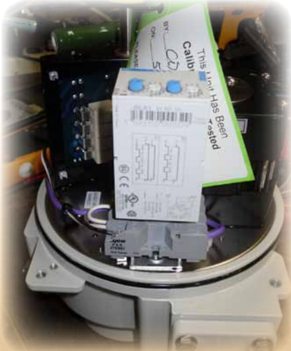
Timer Option installed in a P3-120VAC series actuator

Allows an actuator to open or close more slowly