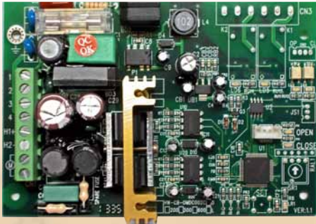
Extended Duty Control Board supplies power and control to the 90vdc motor.

Not all options are available for all models or in conjunction with other options. Call ProMation for more information.